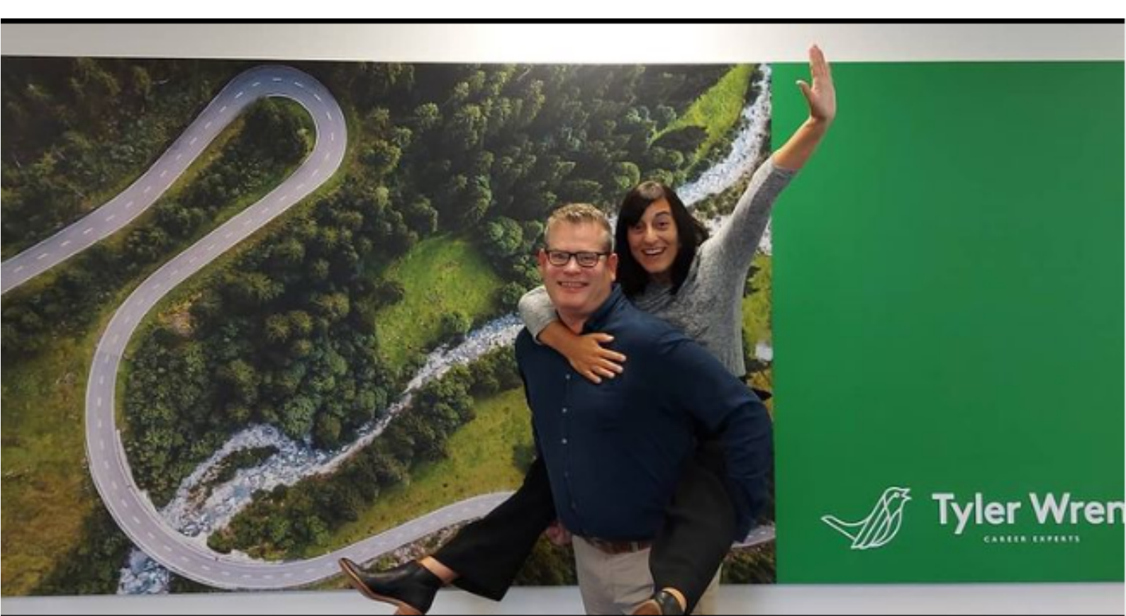
On a final note, our Directors are a hoot and will support you and the team through every obstacle - including how and when to become our latest hire and join us!

Dotty & Boon (left) are our entertainment experts, always on hand to meet and greet our visitors with particular expertise in cuddles and sitting on laps.